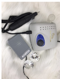
65w, 35.000rpm Efile mk2 extra torque

Powerful Korean micro motor. With 65w of power and a 35,000rpm maximum, the upgraded efile offers more torque and more modern looks than its brother the efile-002, it is an absolutely world class product. Smooth and durable. Convenient storage slots for bits and burs! As used by Russian techs almost exclusively. We are proud to introduce this wonderful yet affordable Efile, at roughly half the cost of similar machines ! Great for removing, shaping and so much more. You will love it!