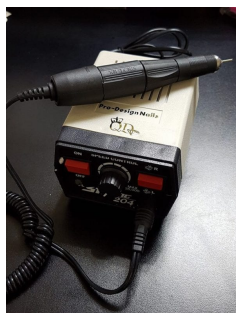
65w, 35.000rpm Efile

Powerful Korean micro motor. With 65w of power and a 35,000rpm maximum it is an absolutely world class product. Smooth and durable. As used by Russian techs almost exclusively. We are proud to introduce this wonderful yet affordable Efile, at roughly half the cost of similar machines ! Great for removing, shaping and so much more. You will love it!